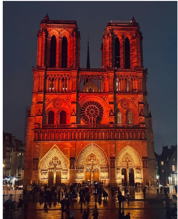
Photo: Paris, November 19, 2025 – Notre-Dame de Paris Cathedral lit up in red, in solidarity with persecuted Christians around the world.

Red Wednesday is observed in many countries, including England, Germany, Italy, Brazil, Mexico, and right here at home!